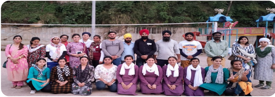
THE WINNER TEAM, TUG OF WAR ( 1 ST POSTION) (Akal College of Health and Sciences)