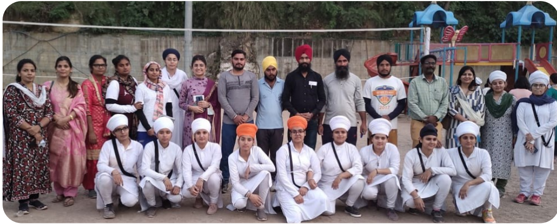
THE WINNER TEAM, TUG OF WAR ( 2 nd POSTION) (Akal College of Education)