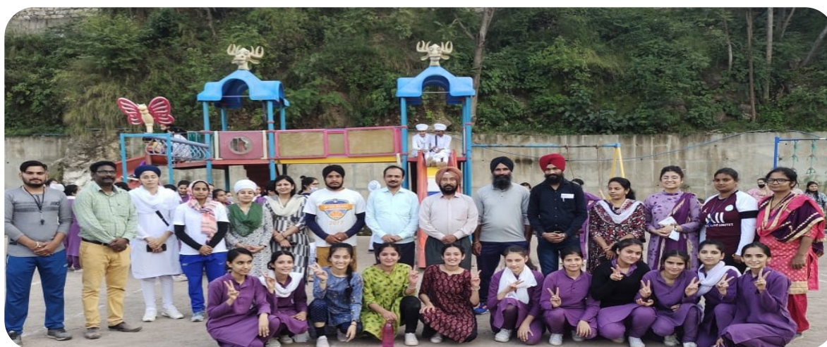
THE WINNER TEAM FOR KHO-KHO (ACN)