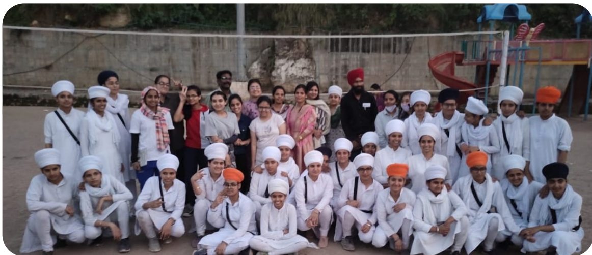
THE WINNER TEAM, TUG OF WAR (3 rd POSTION) (Akal College of Education)